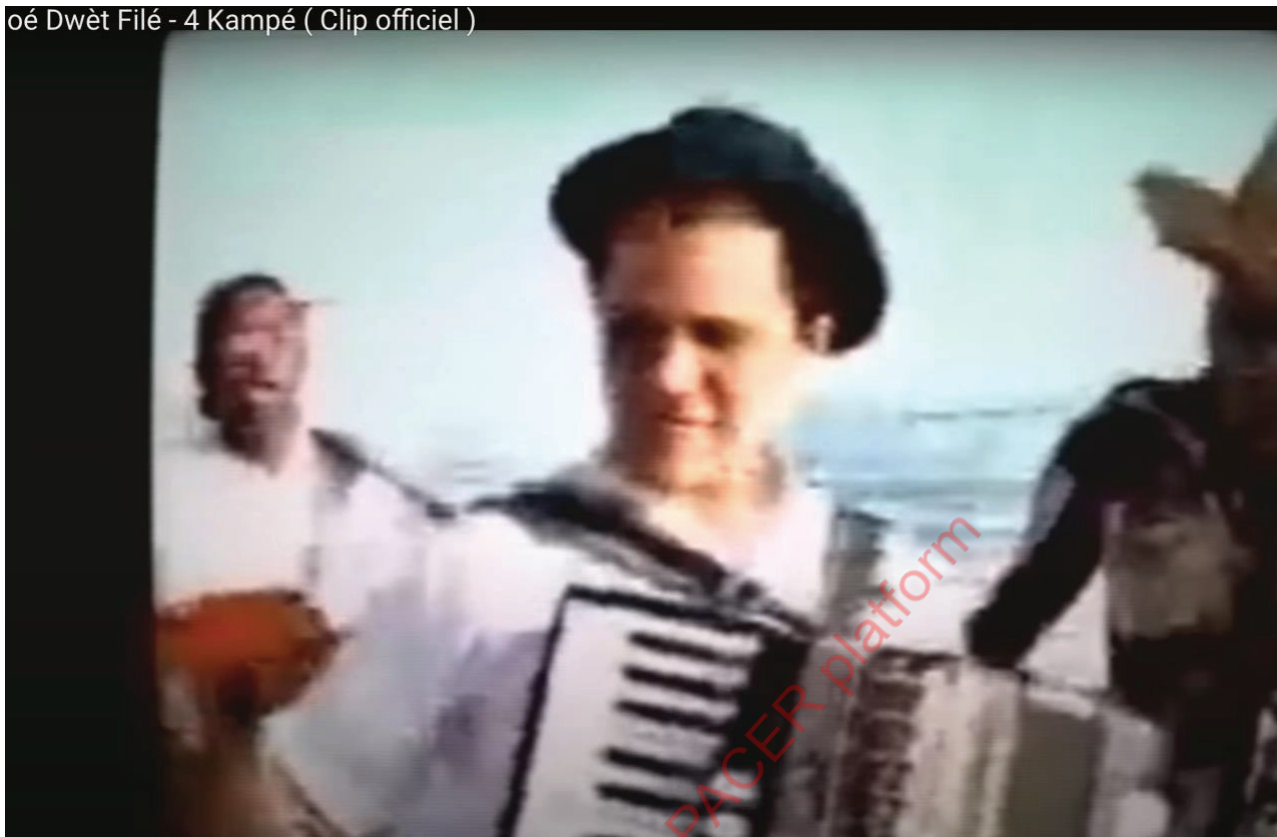
oé Dwèt Filé - 4 Kampé ( Clip officiel )

41. 4 Kampe has been hugely successful. As of April 17, 2025, You Tube Music reports that 4 Kampe has been played 100 million times.