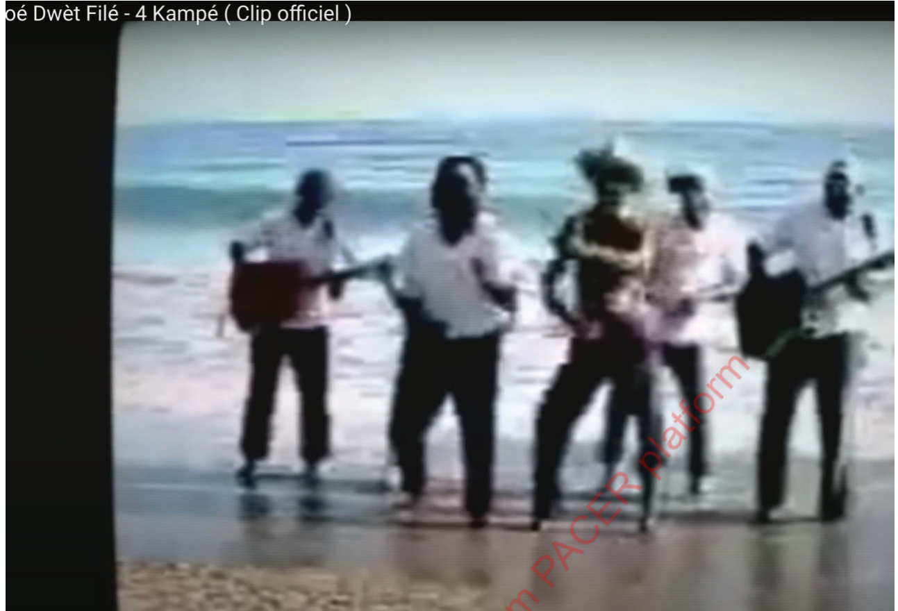
oé Dwèt Filé - 4 Kampé ( Clip officiel )